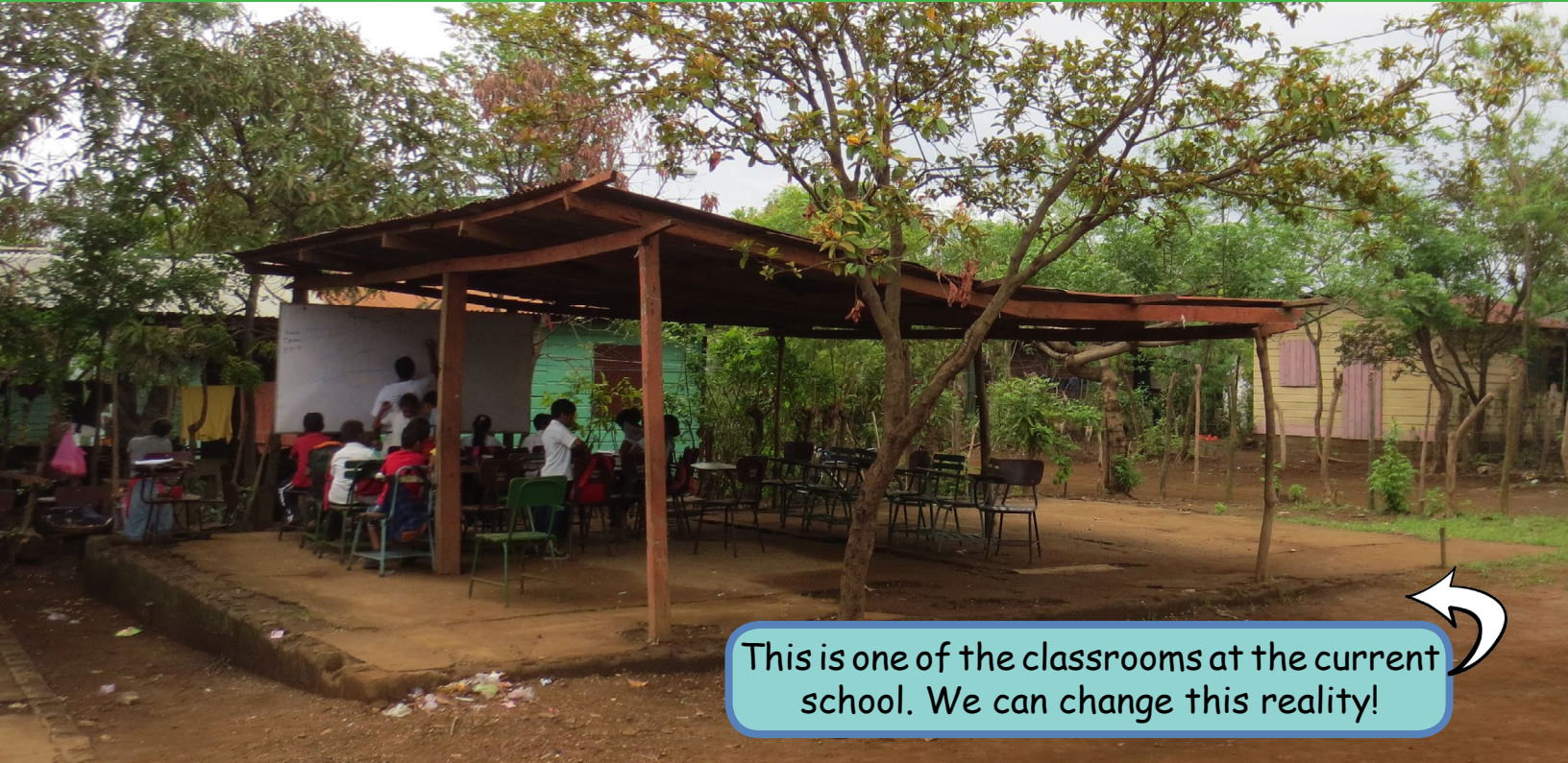
This is one of the classrooms at the current school. We can change this reality!

Together we can Make Education Possible.