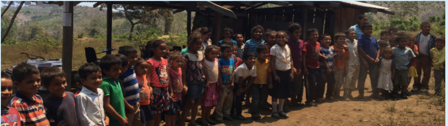
SchoolBOX received a warm welcome from this community that dreams of a new school