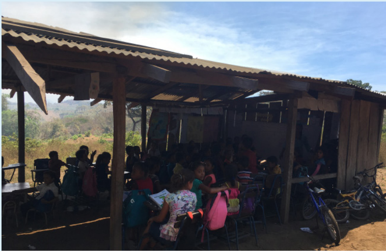
Children at Los Laureles take lessons