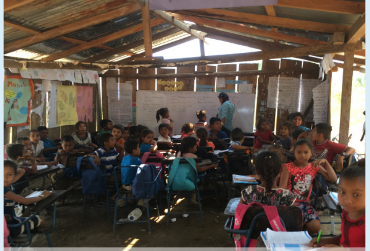
Open-air classroom interior