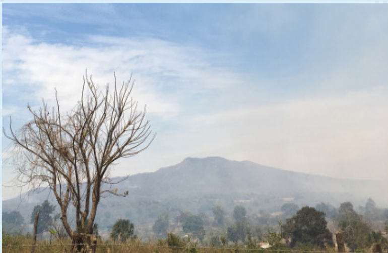
The foothills of Cosignuina Volcano